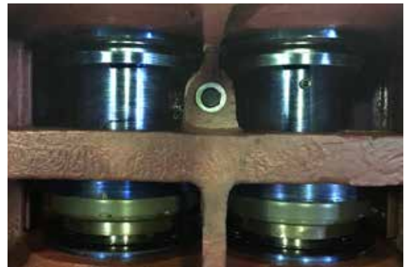
Components (main shafts) for palm oil extract